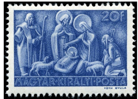
Hungary #618 Christmas Scenes

Renew Your Membership Today or If You Have Never Joined, Now Is the Time