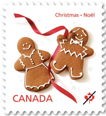
Canada #2583 Gingerbread Cookies