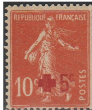
France #B1 Issued 8-11-1914 Overprint of #162

Thanks again to the nominating committee for your hard work.