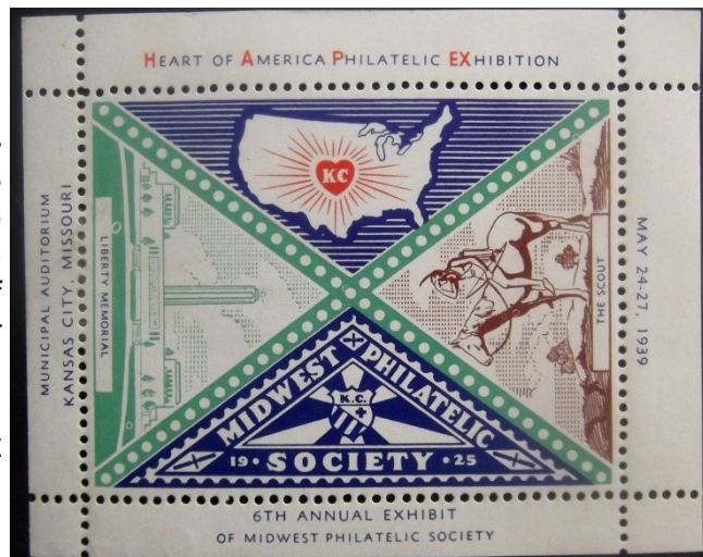
MPS Cinderella Sheet Issued in 1939