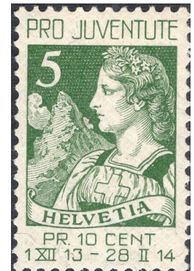
Switzerland #B1 Issued 12-1-1913 Helvetia and Matterhorn

The Midwest Philatelic Society Website is www.midwestphilatelicsociety.com