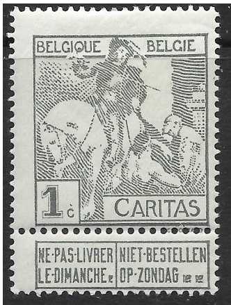
Belgium #B1 Issued 6-1-1910 St. Martin of Tours Dividing His Cloak with a Beggar

So here is the final stamp of the year. Interesting design for a difficult subject. This makes the 6th different subject for USPS on a semi-postal.