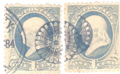
US #206 Separated pair with "Wheel of Fortune" cancel