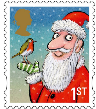
Great Britain #3120 Santa and Robin