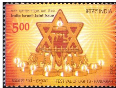
India #2603 Hanukkah Joint Issue with Israel