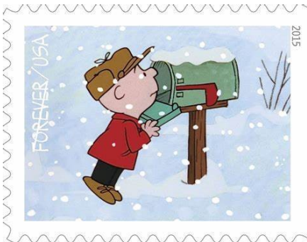
US #5026 A Charlie Brown Christmas