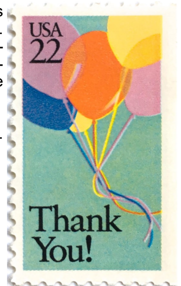
US #2269 Special Occasions Series

Speaking of officers, THANKS. This group is great. You made my job easier. Please continue to help my successor.