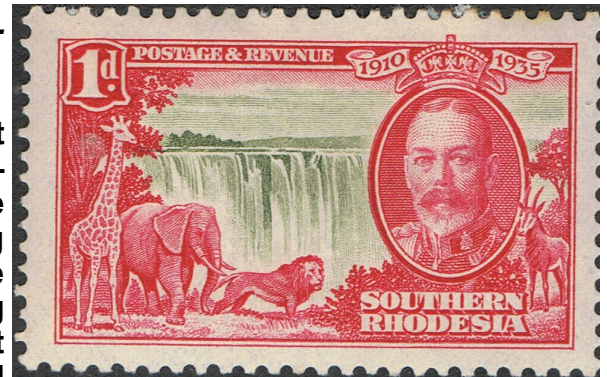
Southern Rhodesia #33 Silver Jubilee King George V, Victoria Falls And Native African Animals